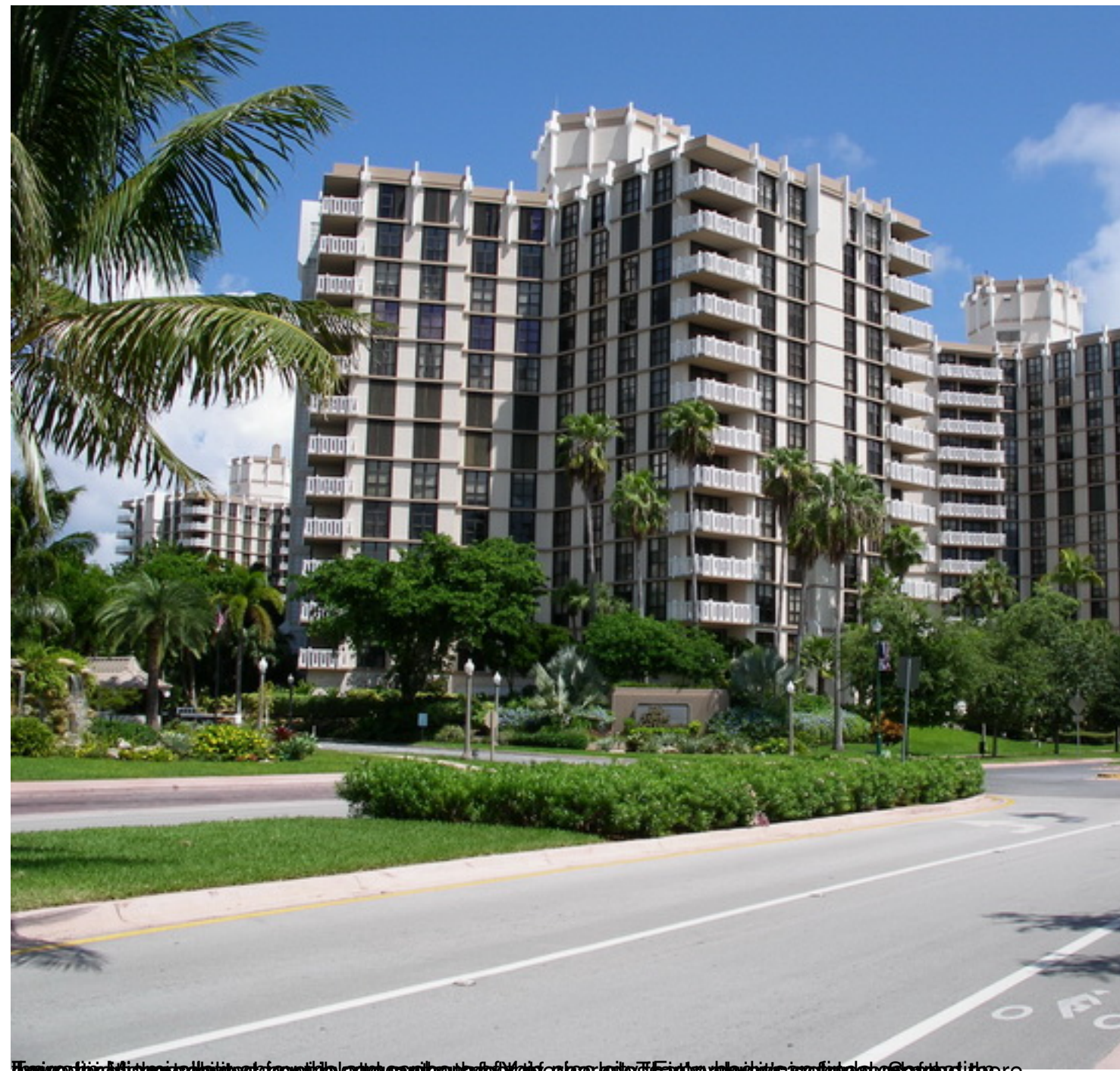
Troinestiinis/listpeistalluisityetajayviirilayatto) espiilveutada@haidestexeckeity: <del>Teidhy</del>ykkojajyhsisagtipholsha@ladephelitoere